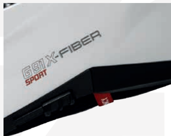
Opening SunVisor device