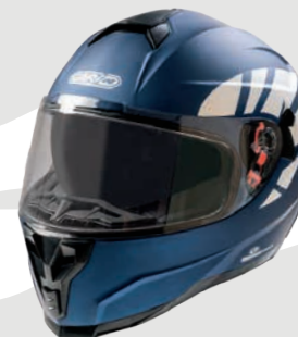
Matt Blue GH9007 MT-BLU