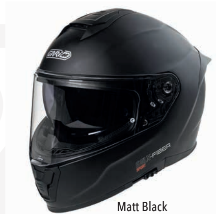
Matt Black GH9034 MT-BLC