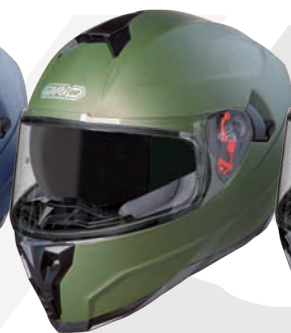
Matt Military Green GH9008 MT-ML-GRN