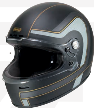
Sedona Matt Black GH9054 MT-BLC