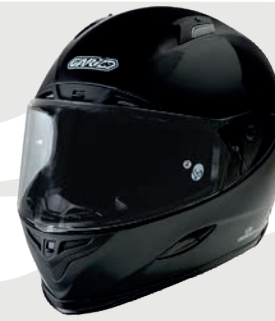
Glossy Black GH9010 BLC