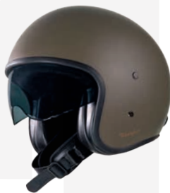
Matt Coffee GH9002 MT-CFF