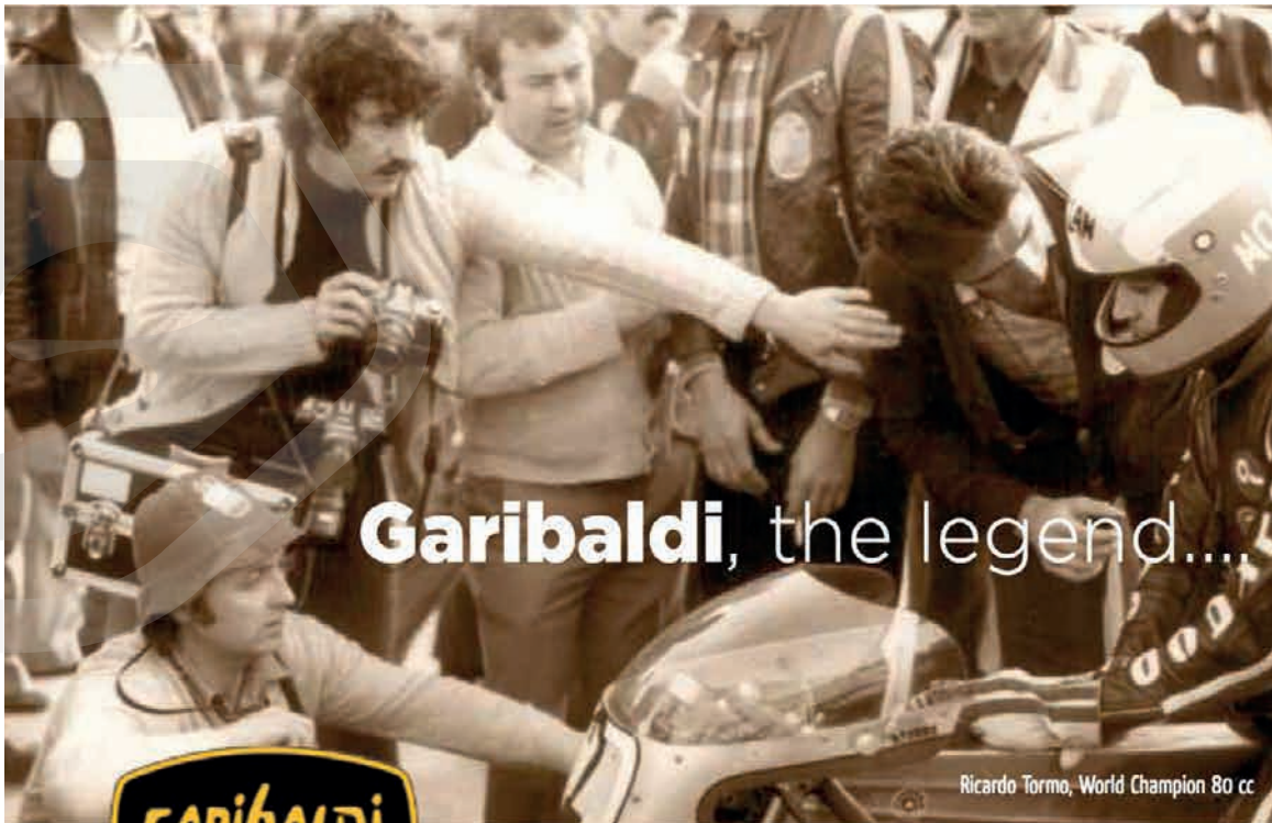
Garibaldi, the legend....