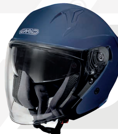
Matt Blue GH9038 MT-BLU