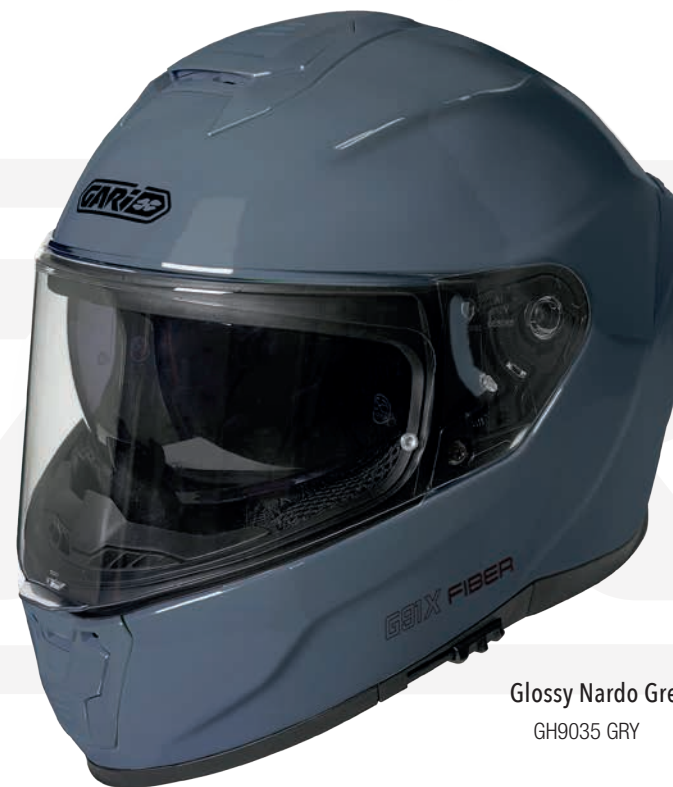
Glossy Nardo Grey GH9035 GRY