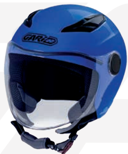
Glossy Cobalt Blue GH9000 CBL-BLU