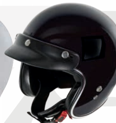
Glossy Black GH9001 BLC