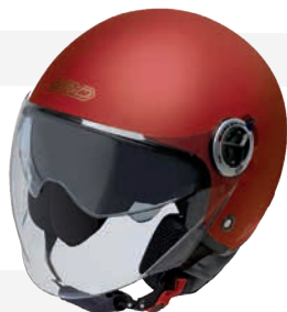
Matt Oxid Red GH9006 MT-OXD-RED