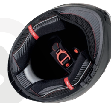
Removable and washable interior made of breathable and anti-humidity fabric