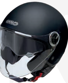
Matt Black GH9006 MT-BLC