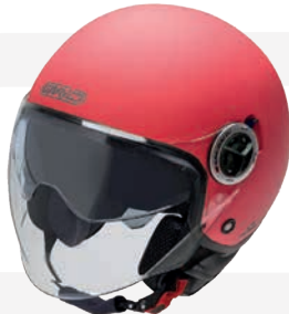
Matt Coral GH9006 MT-CLR-RED