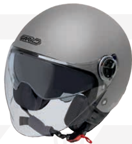
Matt Platinum GH9006 MT-SLV