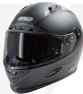
Matt Black GH9010 MT-BLC