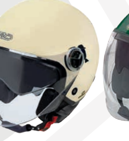
Ivory GH9006 IVR