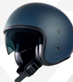
Matt Dirty Blue GH9002 MT-DRT-BLU