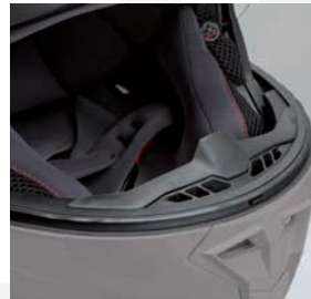
Breath deflector and front air inlet