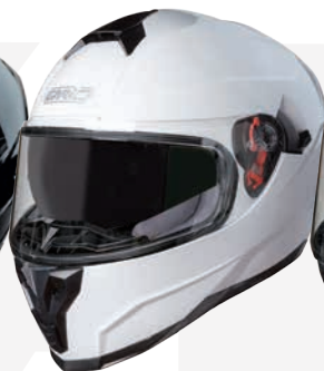
Glossy White GH9008 WHT