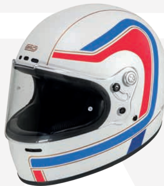
Sedona Matt White GH9054 MT-WHT