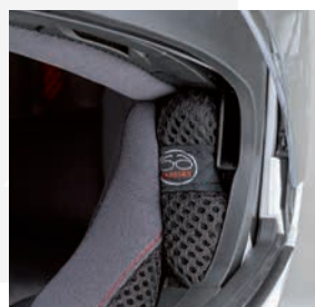
Easy Fit Glasses