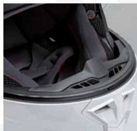
Breath deflector and front air inlet