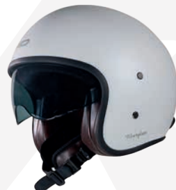
Matt White GH9002 MT-WHT