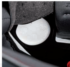
Inner pocket for Speakers