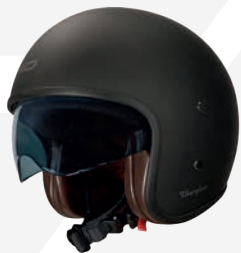
Matt Black GH9002 MT-BLC