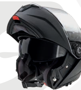
Matt Black GH9005 MT-BLC