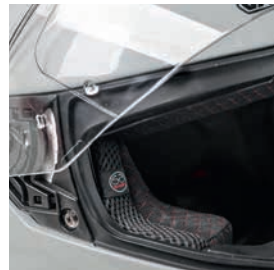
Easy Fit Glasses