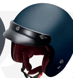
Matt Dirty Blue GH9001 MT-DRT-BLU