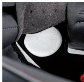
Inner pocket for Speakers