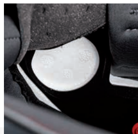
Inner pocket for Speakers