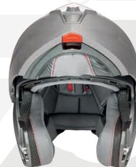
Fully removable and washable interior