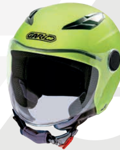
Matt Fluor GH9000 MT-FL