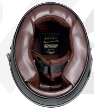
Brown interior for Matt Black