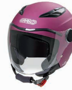
Matt Fuchsia GH9000 MT-FCH