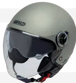
Matt Champagne GH9006 MT-PAL-GLD