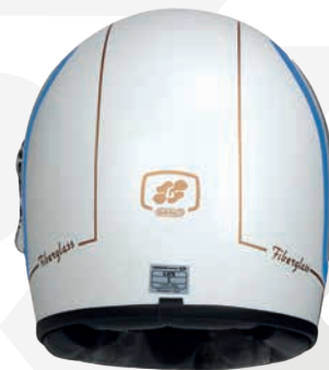
Rear Sedona Matt White