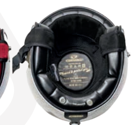
Black Interior for Glossy Black, Matt Black, Matt Titanium Grey, Light Grey and Matt Coal Grey