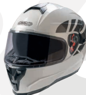
Glossy Pearl White GH9007 MT-WHT