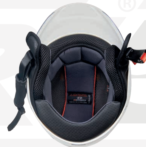
Fully removable and washable interior