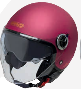
Matt Fuchsia GH9006 MT-FCH