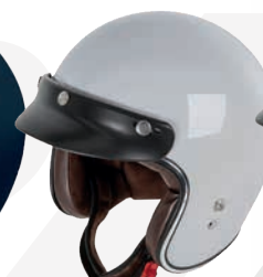
Glossy Light Grey GH9001 MT-LG-GRY