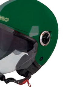
British Green GH9006 BRT-GRN