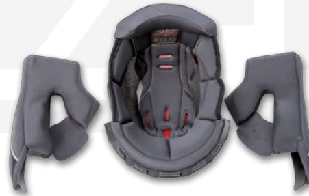
Fully removable and washable interior