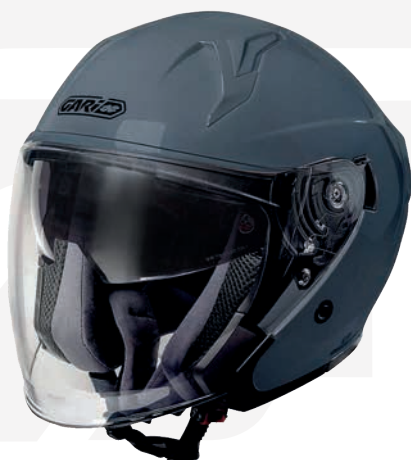
Glossy Nardo Grey GH9038 GRY