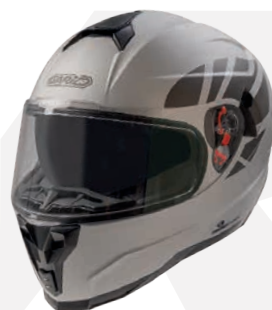
Matt Silver GH9007 MT-SLV