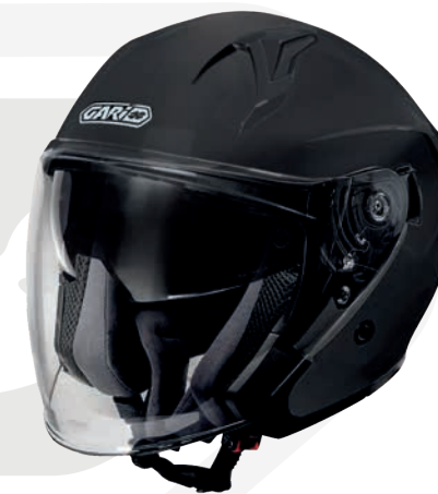
Matt Black GH9038 MT-BLC