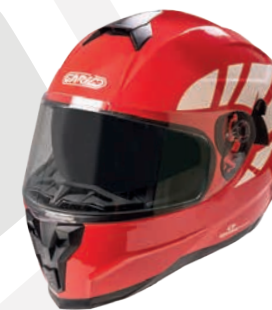
Glossy Red GH9007 RED