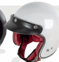
Glossy Pearl White GH9001 PRL-WHT