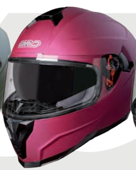
Matt Fuchsia GH9008 MT-FCH