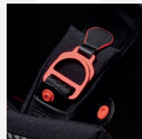
Double D Fastener