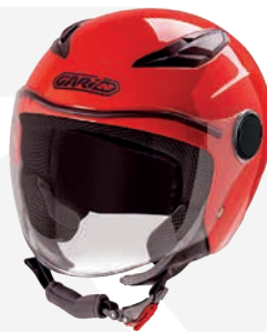
Glossy Corsa Red GH9000 RED