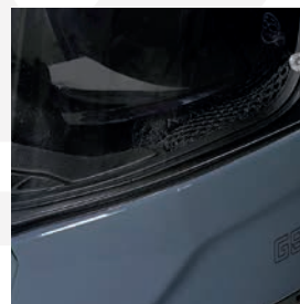
Opening SunVisor device