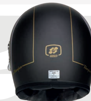
Rear Sedona Matt Black