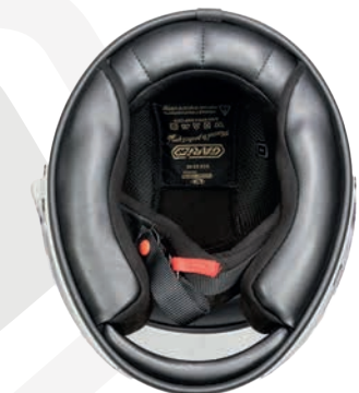
Black interior for Sedona