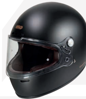
Matt Black GH9032 MT-BLC