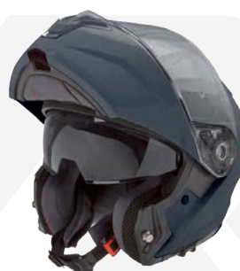
Glossy Nardo Grey GH9005 GRY