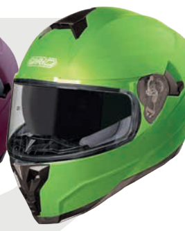
Matt Lime Green GH9008 LMN-GRN