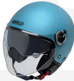
Matt Caribbean Blue GH9006 MT-CRB-BLU