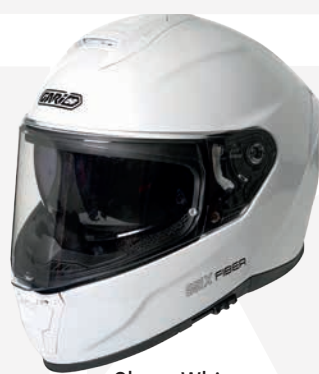
Glossy White GH9035 WHT