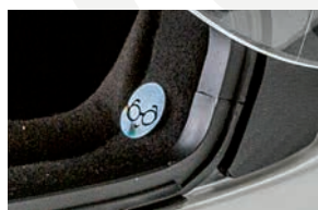
Easy Fit Glasses