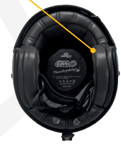
Black for Matt Dirty Blue and Matt Oxid Red