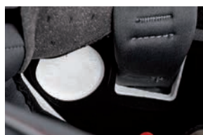
Inner space for Speakers