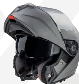
Matt Titanium Grey GH9005 MT-TTN-GRY