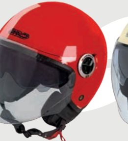
Glossy Corsa Red GH9006 RED