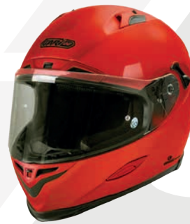
Glossy Corsa Red GH9010 RED