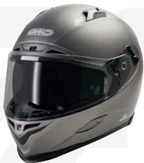
Matt Titanium Grey GH9010 MT-TTN-GRY

Removable and washable interior made of breathable and anti-humidity bamboo fabric