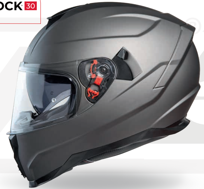
Matt Titanium Grey GH9008 MT-TTN-GRY