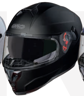
Matt Black GH9008 MT-BLC