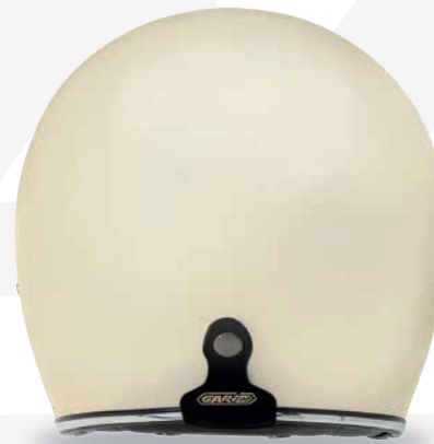
Back closure for external glasses