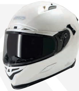
Glossy Pearl White GH9010 PRL-WHT