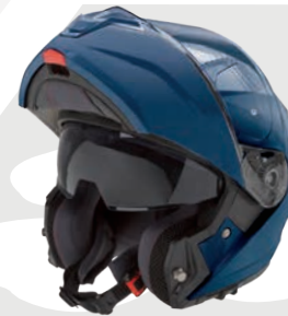
Matt Blue GH9005 MT-BLU