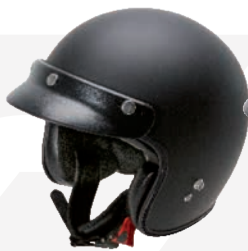
Matt Black GH9001 MT-BLC