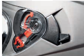
Opening SunVisor device