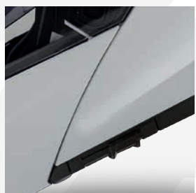
Opening SunVisor device