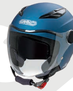
Matt Blue GH9000 MT-BLU