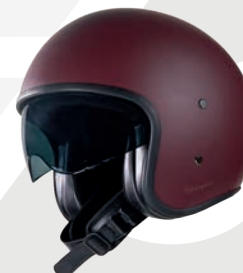
Matt Deep Oxid Red GH9002 MT-OXD-RED