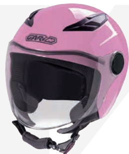
Glossy Pink GH9000 PNK