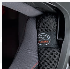
Easy Fit Glasses