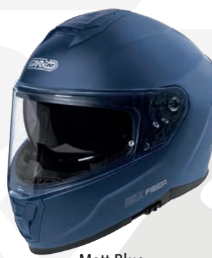
Matt Blue GH9035 MT-BLU