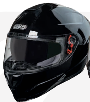
Glossy Black GH9008 BLC