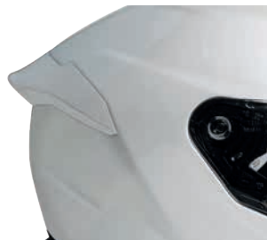
Large Aerodynamic Rear Spoiler