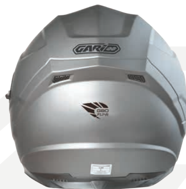
Rear air vents