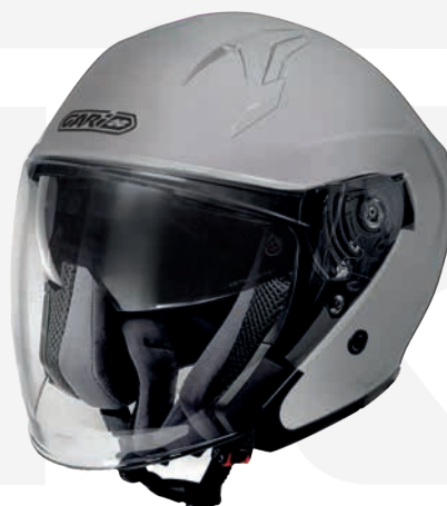
Matt Silver GH9038 MT-SLV