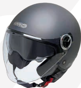
Matt Titanium Grey GH9006 MT-TTN-GRY