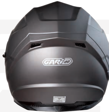
Rear air vents