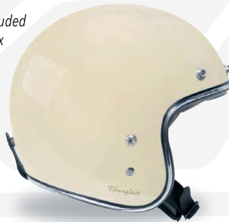
Glossy Ivory GH9001 IVR