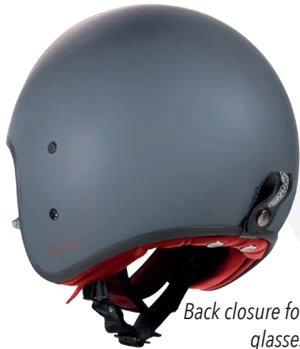
Back closure for external glasses