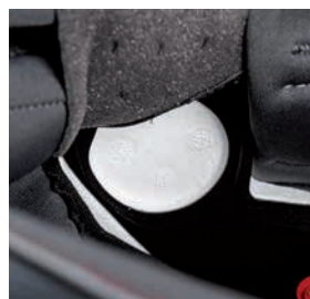
Inner pocket for Speakers