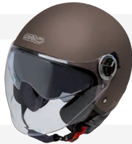
Matt Coffee GH9006 MT-CFF