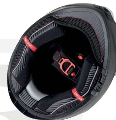
Removable and washable interior made of breathable and anti-humidity fabric