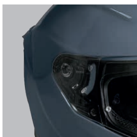
Small Aerodynamic Rear Spoiler