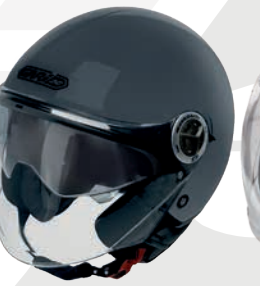
Glossy Nardo Grey GH9006 GRY