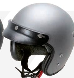
Matt Titanium Grey GH9001 MT-TTN-GRY