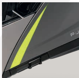
Opening SunVisor device