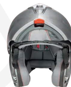
Fully removable and washable interior