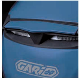
Rear air vents

Sizes: XS to XL 2 outer shell sizes: XS-L / XL XXL Lining available