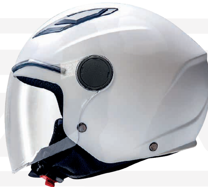
Glossy Pearl White GH9000 PRL-WHT