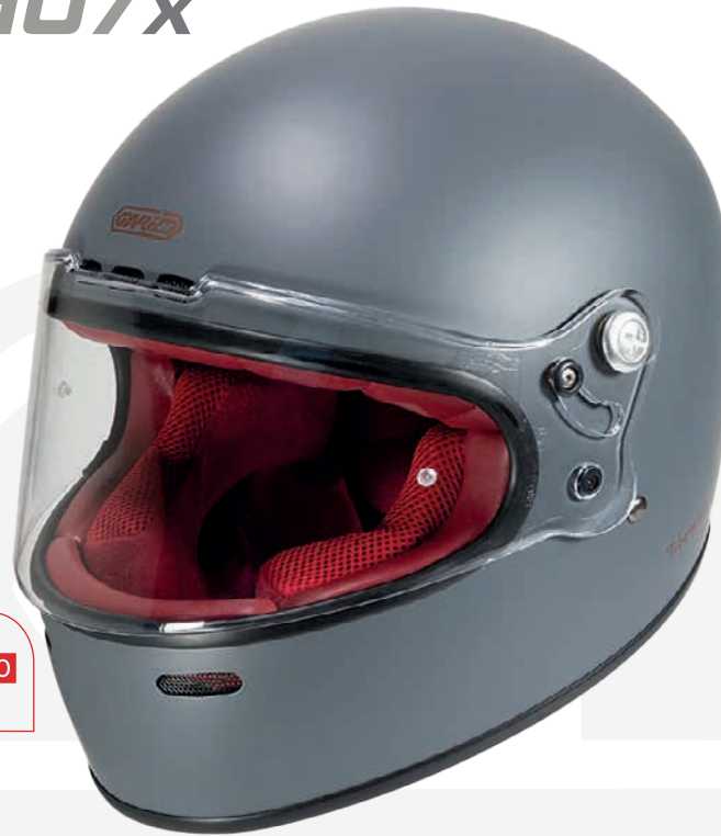
Matt Coal Grey GH9032 MT-GRY