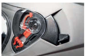
Opening SunVisor device