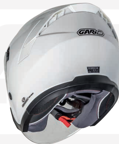
Glossy White GH9038 WHT