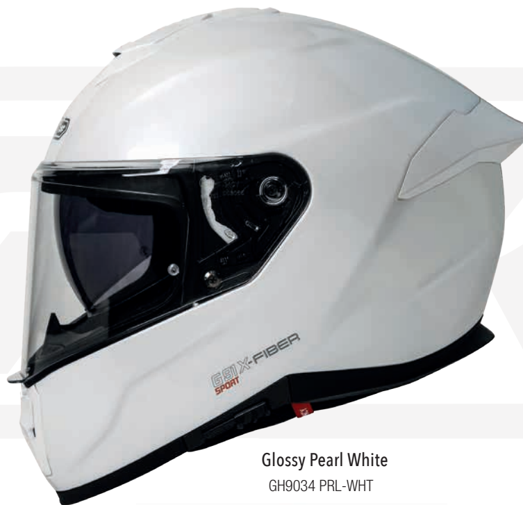
Glossy Pearl White GH9034 PRL-WHT