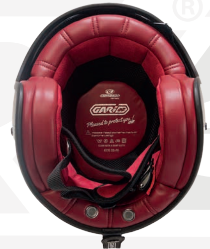
Wineberry interior for Matt Coal Grey Fully removable and washable interior