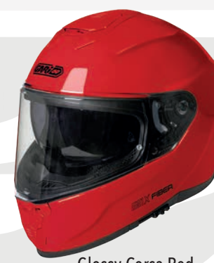
Glossy Corsa Red GH9035 RED