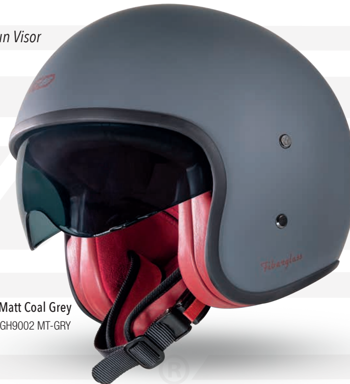
Matt Coal Grey GH9002 MT-GRY