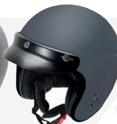
Matt Coal Grey GH9001 MT-GRY