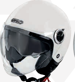
Glossy Pearl White GH9006 PRL-WHT