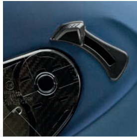
Opening SunVisor device