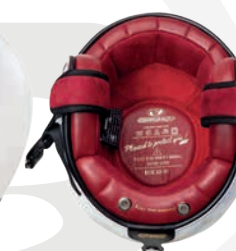
Wineberry interior for Pearl White