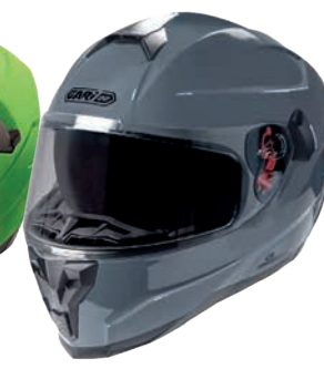
Glossy Nardo Grey GH9008 GRY