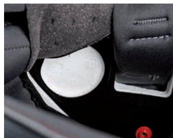
Inner pocket for Speakers