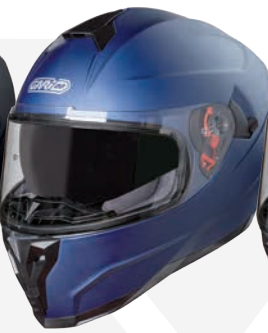
Matt Blue GH9008 MT-BLU