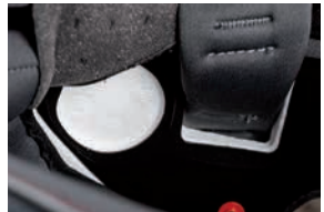
Inner space for Speakers