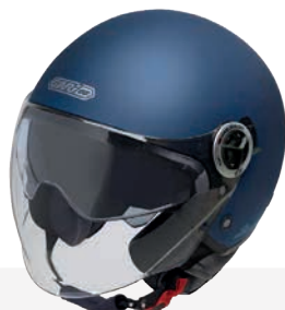
Matt Blue GH9006 MT-BLU