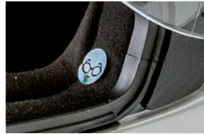
Easy Fit Glasses