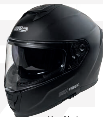
Matt Black GH9035 MT-BLC